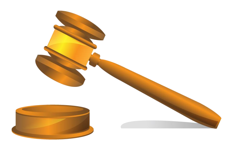
Table 09 Breakdown of Disciplinary Matters